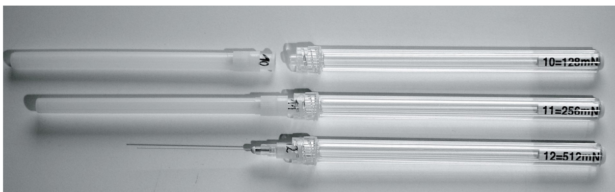
Figure 1: Parts of a von Frey filament: handle, filament and protection cap.