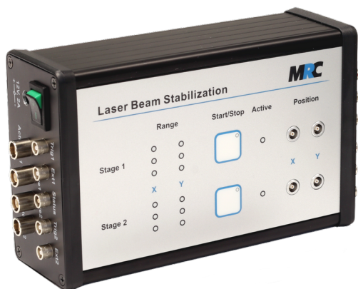
Controller of beam stabilization "Compact"